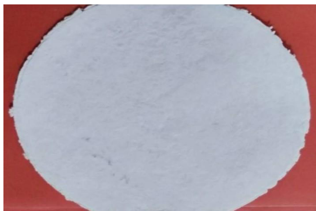
Fig 1: Handmade paper sheet produced from jute fibre (Sample 1)